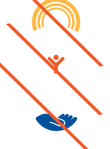
Never extract any of the graphic elements contained in the brandmark to use separately