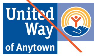
Never add a local name inside the brandmark