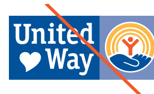
Never add elements inside the brandmark