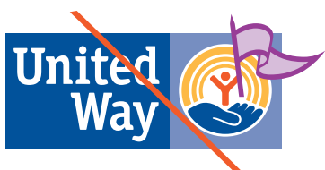
Never add elements over the brandmark