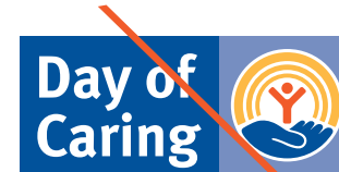
Never put other words or phrases inside the brandmark