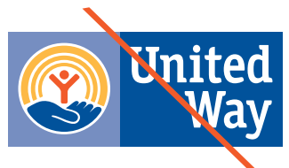
Never rearrange the elements of the brandmark