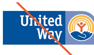
Never alter the shape of the brandmark in any way