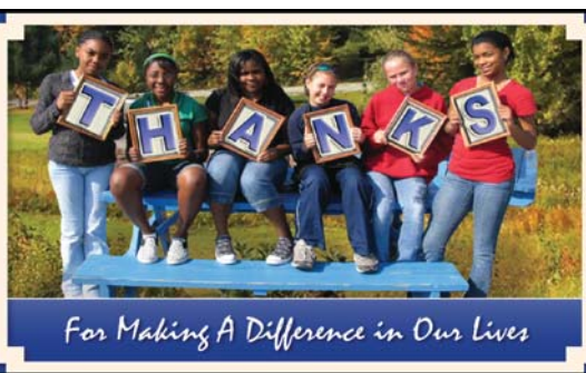
For Making A Difference in Our Lives

Visit us online at www.unitedwaytriangle.org to learn about the difference your gift makes.